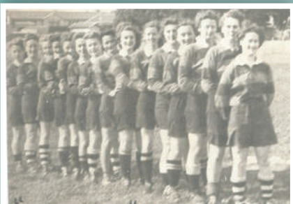
Excelsior Ladies Football Team 1945. The guy's gear was a bit big